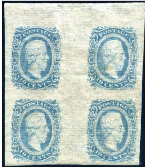
Figure 3. CSA 11, 10¢ blue top sheet margin gutter block of four with textile marks.

Valente goes into more detail than Andersen. I bought his book for the information on paper and was delighted to find an entire chapter addressing the topic of “laid paper” on Confederate general-issue stamps. Valente logically explains this Confederate paper variety via the worn felt theory. Press felt is still in use today in manufacturing paper, playing an important role in removing the water from the paper.