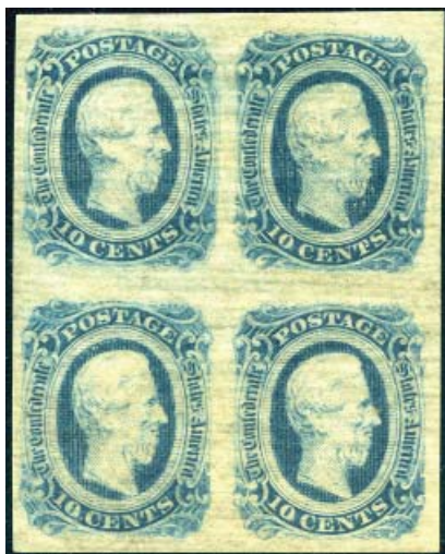
Figure 2. CSA 12-KB, 10¢ dark blue block of four with textile marks.

In his 1929 seminal work, August Dietz 3 likely began the almost century-long firestorm on this topic. No one wanted to take an opposing view to Dietz, who stated: