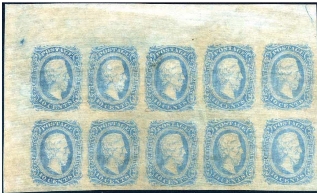
Figure 4. CSA 11-KB, 10¢ dark blue upper-left corner margin block of 10 with textile marks (with characteristic dark original gum).