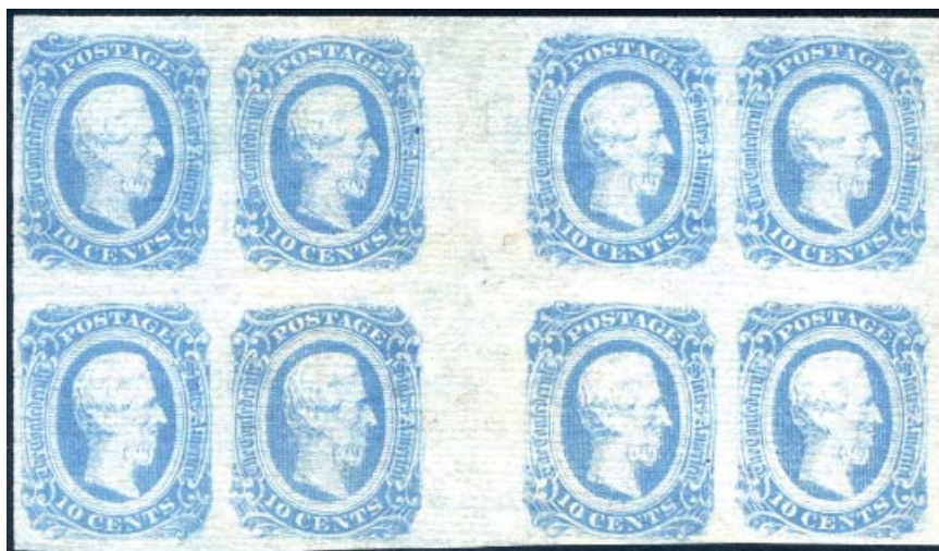
Figure 5. CSA 12a, 10¢ bright blue gutter block of 4 with textile marks.

Most examples I have seen with textile marks appear to be the product of Keatinge & Ball (KB), including scarce bright blue shades. Few others appear to be in lighter shades with greater detail of the cross-hatched lines behind the Davis portrait, these are more often Archer & Daly (AD) printings, although no conclusive determination can be made without forensic testing. It is likely that both printers had worn machinery and produced stamps with such textile marks.