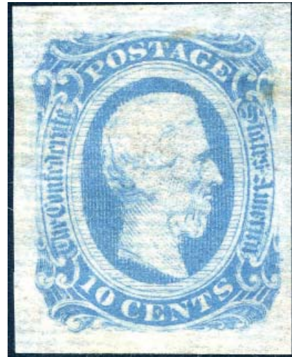
Figure 1. CSA 12-KBa, 10¢ bright blue with textile marks.

It appears that a small quantity of laid paper was used in one of the printings, and stamps of this variety are considered rare. There has been some controversy concerning these stamps on laid paper, but a strip in my reference collection, as well as others coming under my observation, tend to prove the existence of the variety. Claims of a ribbed paper have been advanced, but these can not be definitely established. It is a well-known fact, that Confederate soldiers carried strips of stamps under the “sweat-bands” of their hats, and this lining, being of a coarse, corrugated material, produced, after time, the appearance of ribbed paper.